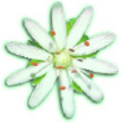
White Flower: Devotion to Duty