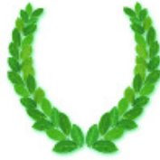
Laurel Wreath: Victory Over Death